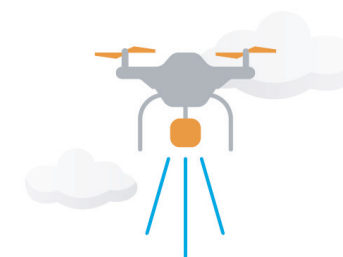
ONSITE REVIEW & FLY