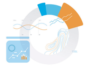
ANALYZE, PLAN & DELIVER