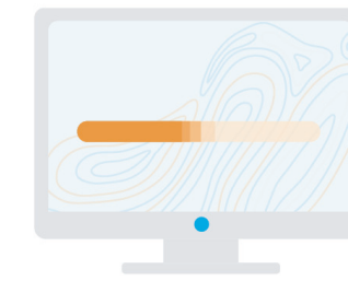
UPLOAD & PROCESS